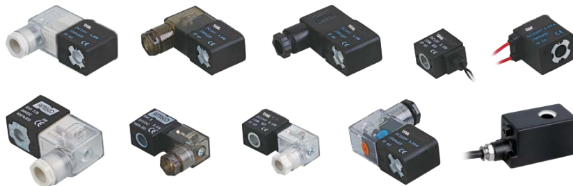
防爆线圈 Explosion-proof Coil